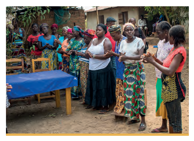
"Before [the self-help affinity group and internal lending], we were sorry – now we praise God!" – Self-help affinity groups in Kawella.

Most of these groups have continued to function beyond the end of the project. The micro-enterprise groups in particular have the ongoing benefit of access to the revolving fund at Union Trust Bank. This is a potentially unending source of credit, as the repayment of existing loans fuels it – thus, the benefits of the SLCDD will be felt long after its official completion.