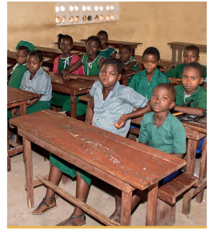
According to pupils at Moyamba District Education Committee primary school, the new school is "comfortable" – the church where they used to teach was "uncomfortable, crowded ... with no seats or benches." The new school also has "fixed blackboards, toilets and a well, and seven teachers" (they used to have only two teachers).

Overall, the SLCDD project was a resounding success. Across the country, the beneficiaries – the people who gained access to new infrastructure, or benefitted from group support and micro-credit – are singing its praises for the changes it has made to their lives.