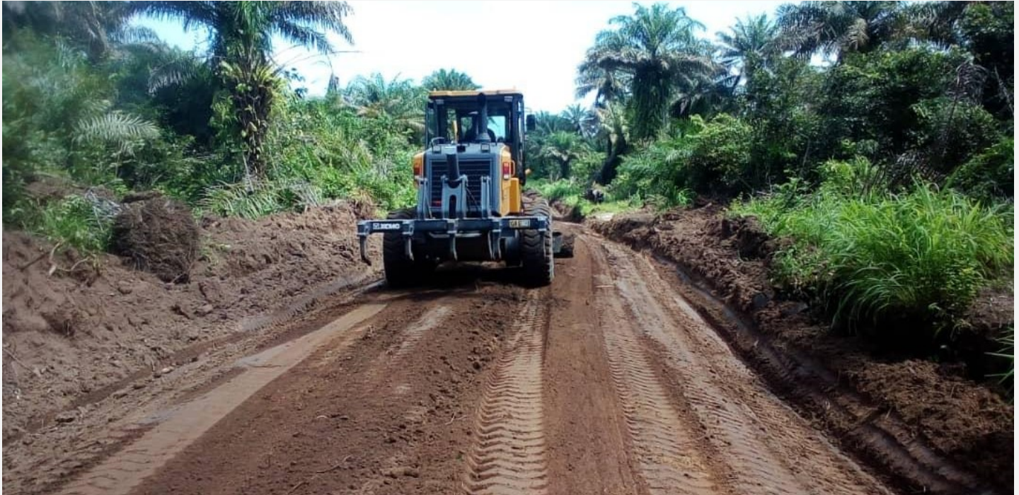
150 kms Feeder Road Moyamba, Kenema, Karene, Port Loko and Tonkolili districts under rehabilitation by the SLRDD II

One of the key building blocks for enhancing a sustainable feed the nation - food security - national agenda is access to Markets by farmers. For farmers to realize profit from their produce they need to access the market themselves and not deal solely with unscrupulous middleman. They also should access the market for improved farming inputs and tools. That is what exactly NaCSA has been doing and has now hyped in response to Government's call to duty for enhancing sustainable food security in SL. This road rehabilitation is taking place in Moyamba, Kenema, Karene, Port Loko and Tonkolili districts. 150 kms of Feeder Roads will be rehabilitated with funds from IsDB and GoSL