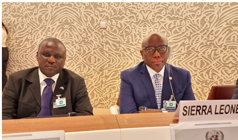
Amb. Ndomahina and RC Farama Bangura at the session

Geneva, Switzerland, Commissioner Ndomahina informed delegates that Sierra Leone created the National Commission for Social Action shortly after the end of the civil war in 2002 to provide essential services to displaced Sierra Leoneans and refugees from neighboring countries. This demonstrates her avowed commitment to protecting refugees and displaced persons in global solidarity for strengthening partnership.