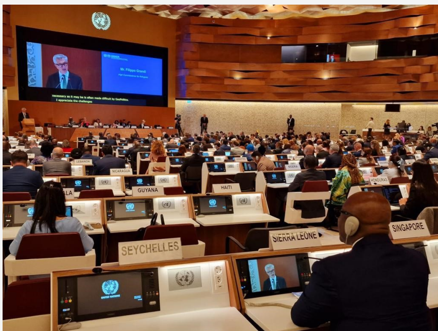
NaCSA Commissioner Amb. Ndomahina the session

He assured the committee that Sierra Leone would continue to support the normalization of lives of refugees and vulnerable persons, thus enhancing development of a road map for UNHCR disengagement with established structures, systems, processes, and procedures for a successor project, the “Tenki Salone” Project. The “Tenki Salone” Project is NaCSA’s mechanism of compensating host communities through the implementation of socio-economic infrastructure projects for concrete solutions and opportunities for the remaining caseload of 385 refugees in their respective host communities.