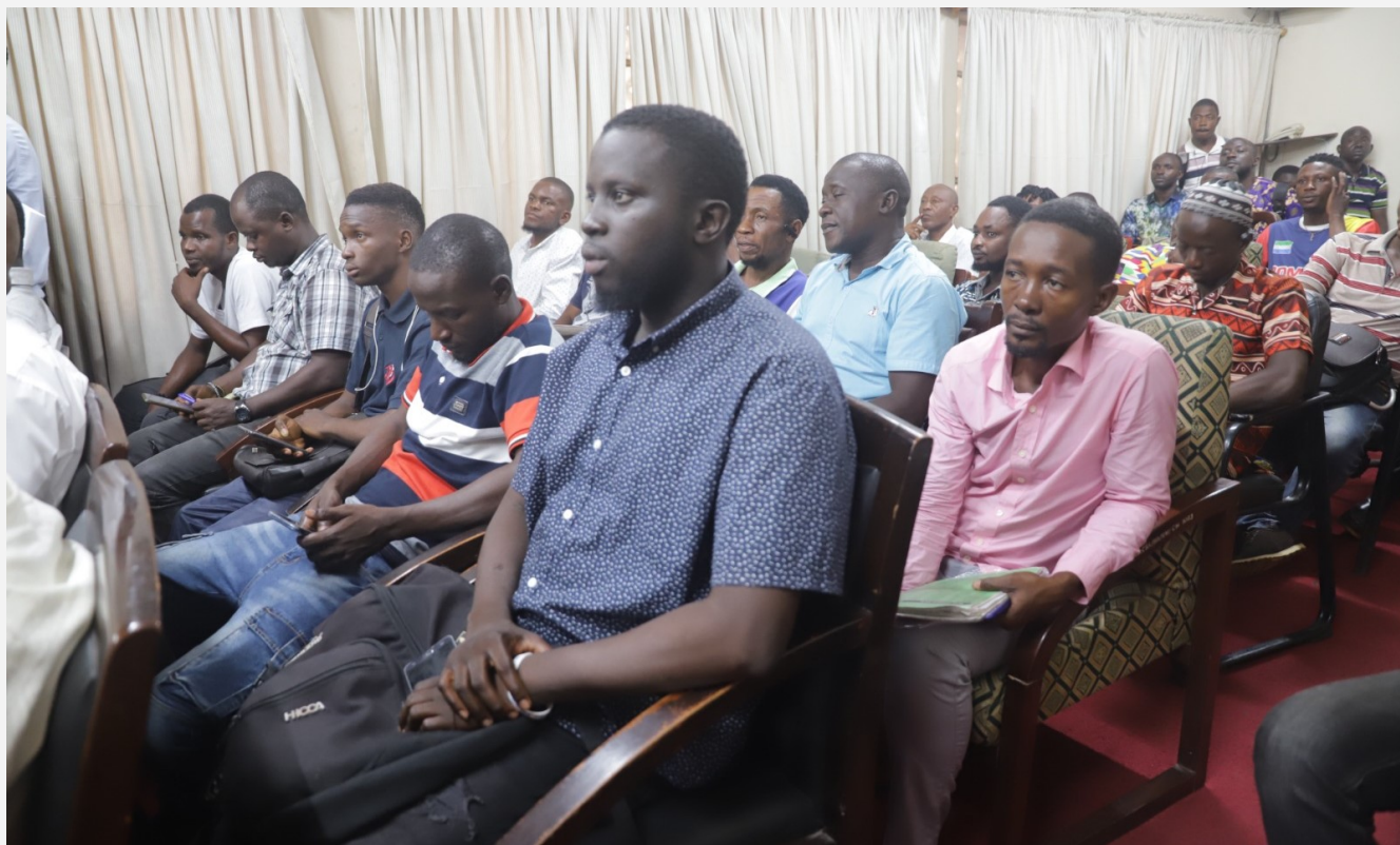
Cross section of participants at the training

The National Commission for Social Action (NaCSA) through the Sierra Leone Community Driven Development Project (SLCDDP II) on Thursday 5th October, 2023 trained engineers of successful contractors for the Water Harvesting and Irrigation Systems sub-project at the Commission's conference room at Charlotte Street, Freetown.