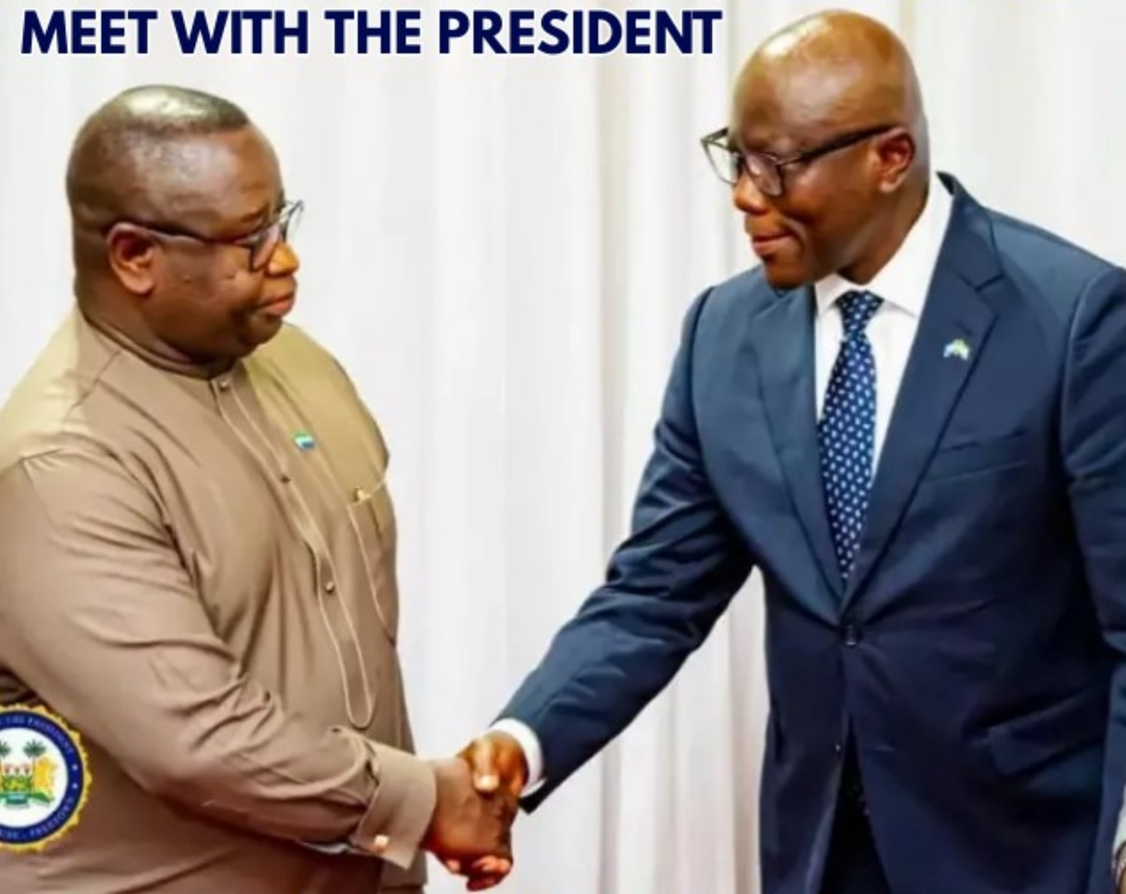
NaCSA PAYS COURTESY CALL ON THE CHIEF MINISTER