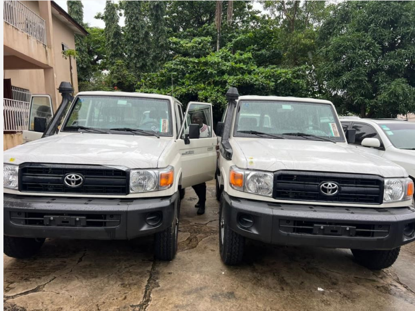
Two of the four vehicles presented to MOYA and NAYCOM by NaCSA

The four new vehicles were delivered by the Commissioner of NaCSA, Ambassador Ernest Ndomahina and received by the