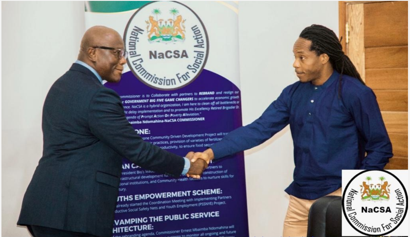
NaCSA Commissioner Amb. Ndomahina sharing hand shake with the Chief Minister

The Commissioner of NaCSA, Ambassador Ernest Mbaimba Ndomahina and his team of experts from NaCSA have on Monday 28 August 2023, paid a courtesy visit to the Office of the Chief Minister. This is in line with the ongoing rebranding strategy to strategically reposition NaCSA to deliver on the government’s “Big Five”.