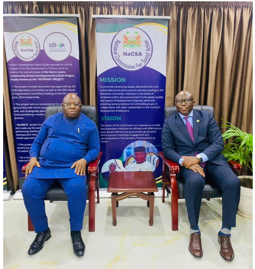
NaCSA Commissioner Amb. Ndomahina and successor Ambassador designate to the peoples Republic of China

The incoming Ambassador further promised to prioritize the implementation of projects the two governments have agreed on, and to work with the Government of The People's Republic of China in ensuring the swift implementation of President Bio's Big Five game changers.