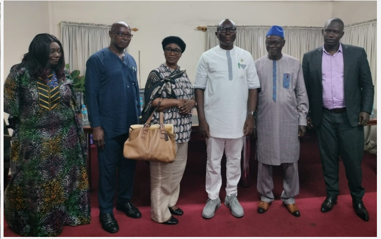
The Symbolic transferring of leadership from the outgoing to the New NaCSA Commissioner