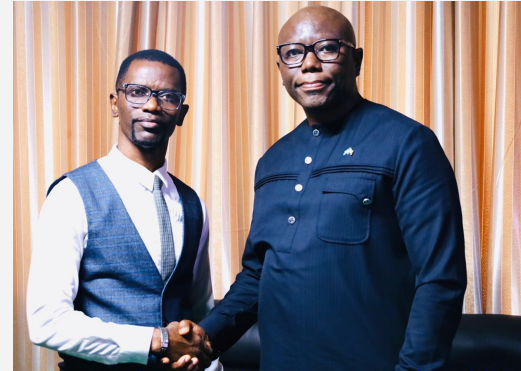
The New Commissioner of NaCSA With Dir. HR/Admin