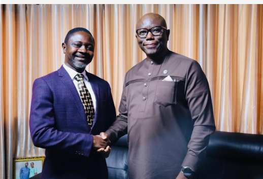
The New Commissioner of NaCSA With PM -IEC