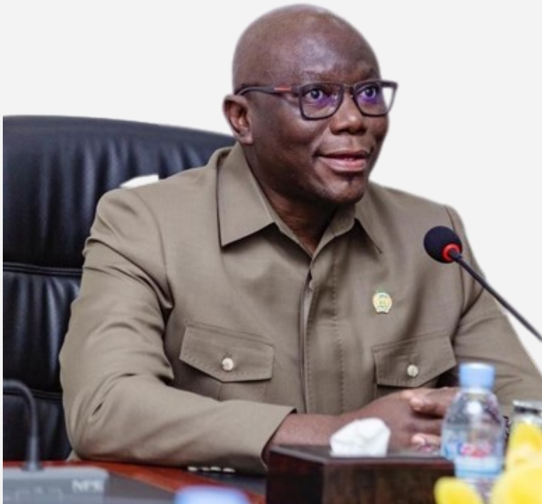
Amb. Chief Ernest Mbaimba Ndomahina, The New Commissioner of NaCSA

Amb. Ernest Mbaimba Ndomahina, the NaCSA Commissioner designate, was among the twenty nine (29) Presidential appointees (Ministers and Heads of parastatals) approved on Thursday, July 27 th 2023 by