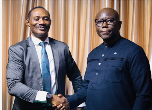
The New Commissioner of NaCSA With SDSS