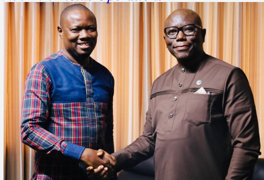
The New Commissioner of NaCSA With PM - HR/Admin