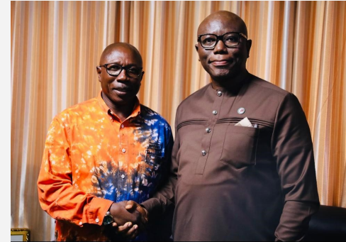
The New Commissioner of NaCSA With PM -SLCDD II