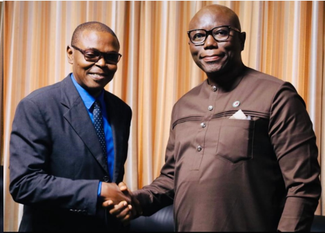
The New Commissioner of NaCSA With Dir. Fields Operations