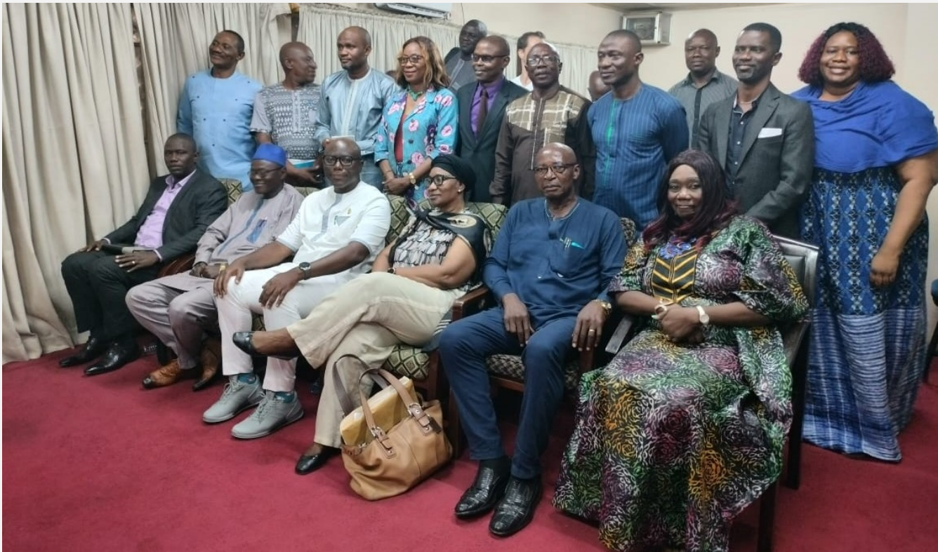
Cross section of NaCSA Management, staff and Board members at the reception ceremony

The event which was marked with mixed feelings from members of the Board and staff of the Commission was treated maturely to end well. An acknowledgement that all is well that ends well.