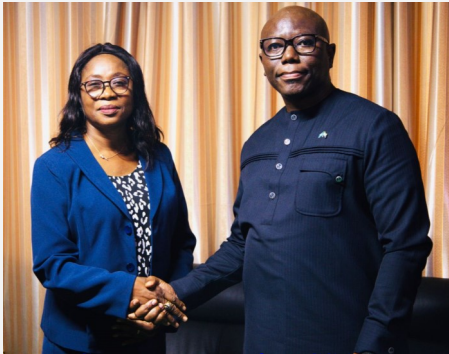
The New Commissioner of NaCSA With SD PDQA