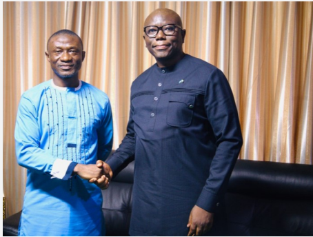
The New Commissioner of NaCSA With Dir. Finance