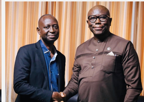
The New Commissioner of NaCSA With World Bank Rep