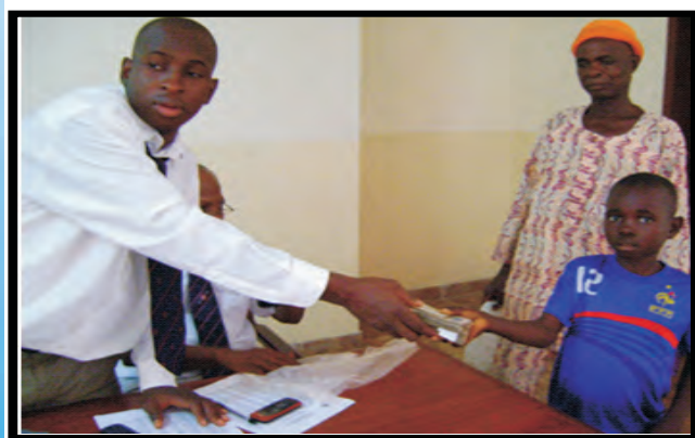
Educational Support to a Child Victim

The programme have initiated an understanding with the Ministry of Education, Science and Technology (MEST) to waive the tuition fees of children of victims, many of whom are now in universities. However, this trend was however a bi-lateral arrangement with the Ministry and has never been made a rule.