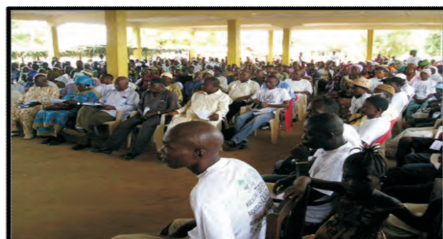
Psychosocial Counseling in Bo District

The programme considered it a priority to provide these victims with some psychosocial training in order to de-traumatise them and provide the opportunity to enable them to re-align their thinking to normal beings before they were engaged in any productive activity. It was for this reason that NaCSA contracted the services of a variety of Civil Society Organisations (CSOs) experienced in trauma healing and psychosocial counselling to rehabilitate and re-orientate the minds of the victims.