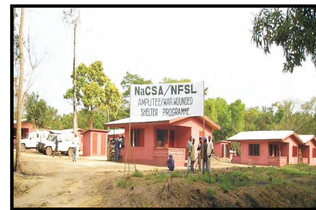
Sample of a cluster of shelters for war victims (Built Nationwide)

It was in response to this acute need faced by victims that the Norwegian Refugee Council (NRC), the Norwegian Friends of Sierra Leone (NFSL) and the Catholic Mission collaborated with Government to provide such facilities which have reduced teenage pregnancy and enhanced schooling amongst children of war victims.