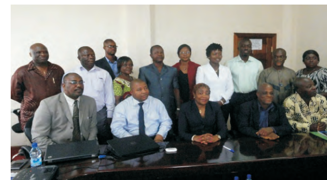
INCHR Liberia Reps. & NaCSA Staff

Liberia he lamented shared almost the same experience with Sierra Leone as a result of the civil wars in both countries. 'I am optimistic that lessons learnt from this study tour will be shared with our commission and other counterparts' he added.