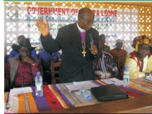
Former TRC Chairman, Conducting Symbolic Reparation in Bomaru, Kailahun District

The TRC intervention was a necessary tool to heal communities, as it played a vital role in providing a forum for perpetrators and victims to re-unite, retrospect and visualize the hazards of the civil conflict, thereby recognising the need to reveal the truth and denounce war as a means to seek redress. In addition, the intervention was specifically designed to help communities restore civic trust, as the lack of trust on the Government was an ingredient in some of the antecedents that led to the war. This symbolic reparation was held in 40 out of the 149 chiefdoms in the country (at least 3 per district) and it brought together both religious and traditional leaders in observance of the symbolic consecration of communities, sacred places and the dead believed to have been desecrated during the conflict. The symbolic cleansing of the community, the confessions by perpetrators, the vigils and the symbolic burials of the dead were the main highlights of the ceremony in every community/chiefdom.