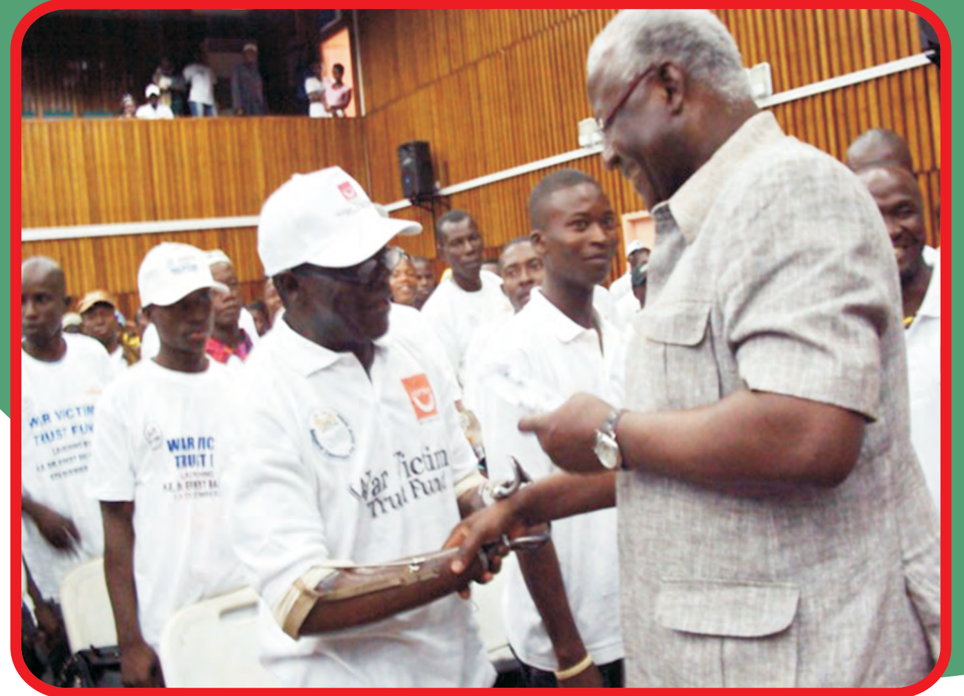
H. E. The President Empathizing and Interacting With War Victims