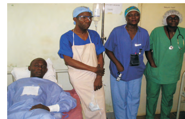
Consultant Surgeon and team preparing to perform surgical operation for removal of bullets and fragments from a victim

Many of these victims of Fistula were identified, moved to Freetown, and given free surgical services facilitated by the Programme. A package which included a small grant, clothing, and transport fare was provided for each discharged patient. A total of 235 women benefitted from the fistula surgery. These women who had lost their status and were stigmatised, discriminated against, rejected and left in shame had their dignity restored after the operation. Most of these women went back to their communities in happiness and correct state of mind.