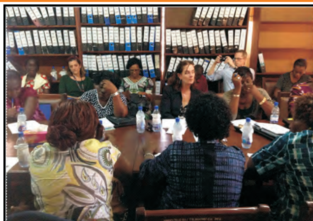
Experience sharing session between NaCSA Reparations Staff and UN Team

The major donor of the Reparations Programme, the United Nations (UN), released a team of experts in 2012 and 2013 to conduct an assessment of the process of implementation to determine whether it was in line with TRC recommendations cum international standards or not. During and after the consultations, the UN team discovered that the programme was being handled with unique skilfulness and a sense of purpose, thus the team was very impressed with the strategies and delivery mechanisms employed in addressing the emerging needs of the victims—though this was the first time such a programme was implanted in the country. In addition, the Sierra Leone Reparations Programme was reckoned as playing a pivotal role in the restoration of peace, unity and stability in the country.