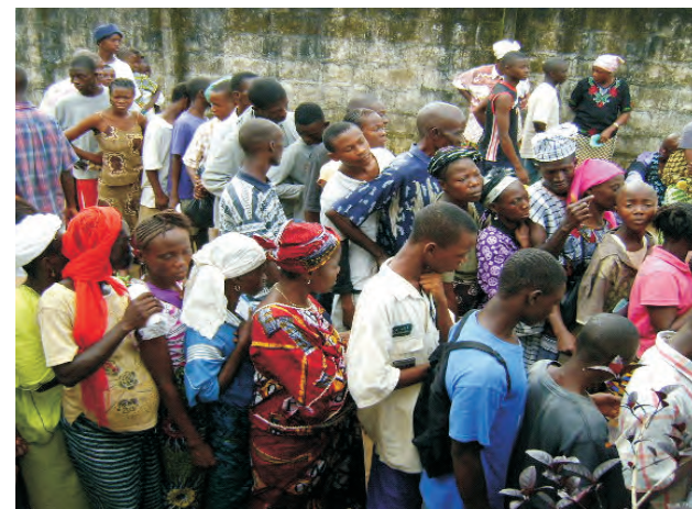
Beneficiaries from all 5 categories queuing for Interim Cash Grant

The grants are meant to be invested in income generation activities after effective complementary training on how to manage their finances. Grant given out to war victims has in diverse ways made immense contribution in rebuilding their lives; though it has also got its own associated disadvantages. For those who are hardworking and enterprising, the grants have indeed made tremendous impact in transforming their lives and restoring their dignity.