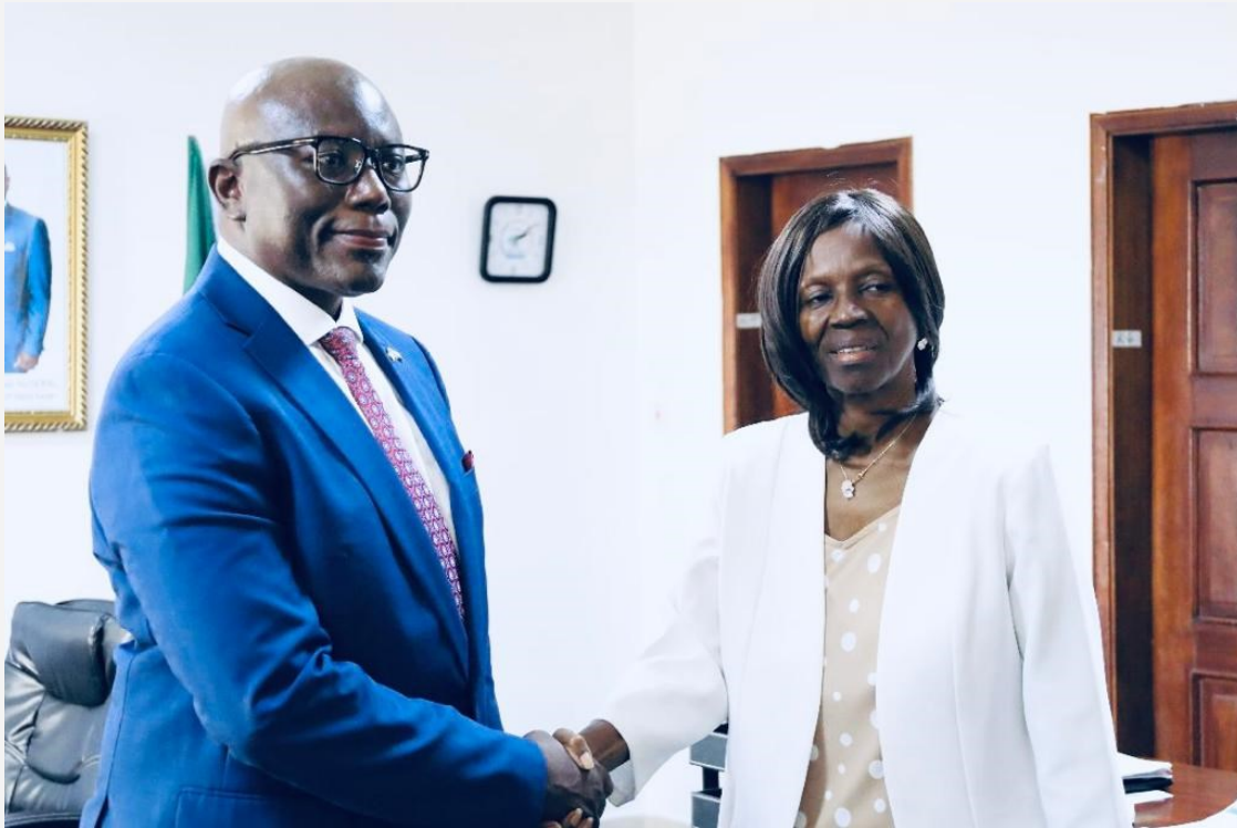
Amb. Ndomahina and the Minister of Development & Economic Development

It may be noted that Ambassador Ernest Mbaimba Ndomahina created a clear road plan to rebrand NaCSA when he was appointed as the organization's Commissioner. The numerous internal meetings with the strategic management team and his unprecedented visit to employees continue to be phenomena and within the rebranding context.