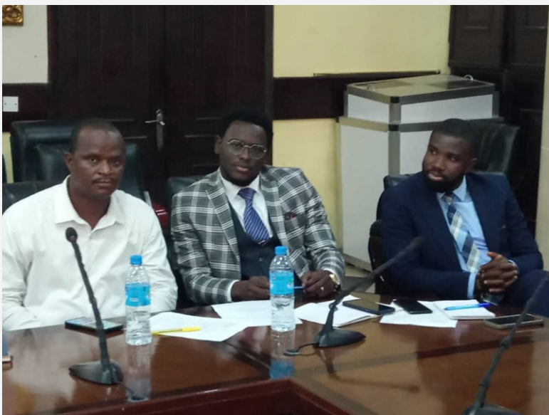
The NaCSA SLCDD II Agric. Specialist, Project Engineer and Micro Finance Specialist in attendance

The Project is co-funded by the government of Sierra Leone and Islamic Development Bank.