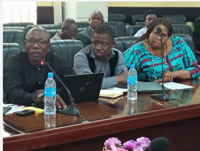
The NaCSA SLCDD II Programme Manager, Procurement Specialist and the Financial Management Specialist in attendance