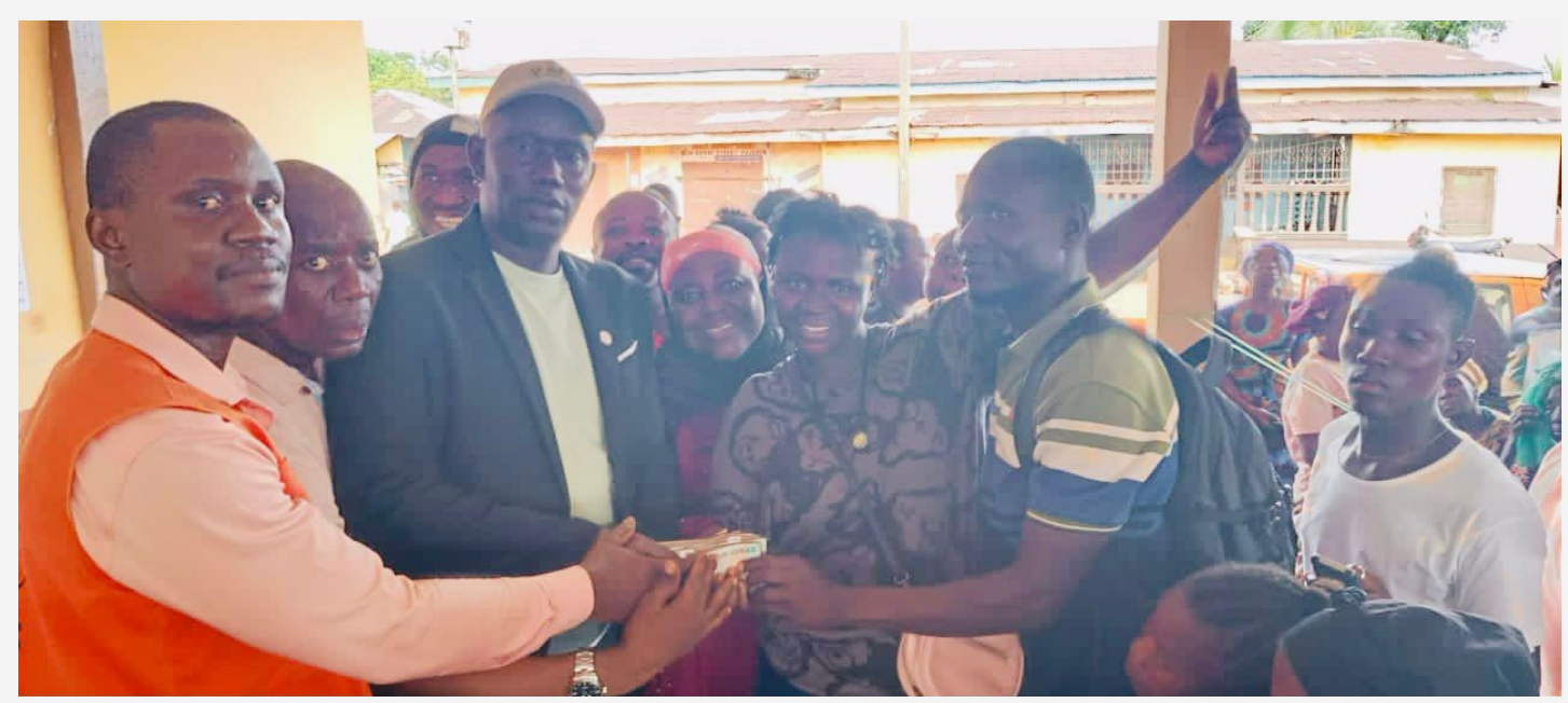
NaCSA Deputy Commissioner, Sir Jimmy Batilo Songa performing the symbolic payment to beneficiaries

The Deputy Commissioner of the National Commissioner for Social Action (NaCSA), Sir Jimmy Batilo Songa has on Tuesday October 17, 2023 commenced monitoring of the third phase of the Emergency Cash Transfer (ECT III) in Pujehun District.