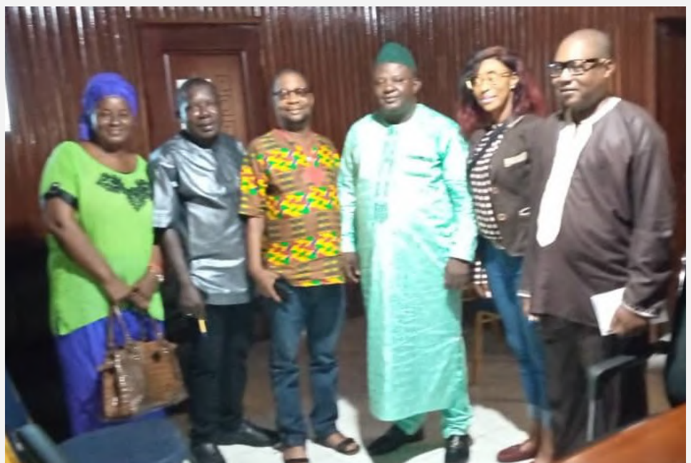
Resident Minister East posing with NaCSA Regional staff in Kenema

In his response, the Resident Minister- East assured NaCSA of his fullest support and collaboration to promote the President's "Big Five Game Changer" in order to actualize his dream. He concluded by informing the NaCSA that his office was always open for fruitful dialogue.