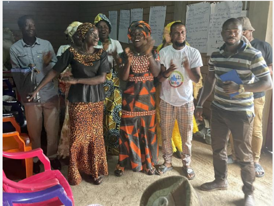
The session was highly demonstrative with participants expressing great appreciation

Traditionally, FMC bookkeeping relied heavily on paper ledgers, with minimal access for NaCSA HQ to gain insights or gauge the economic performance of the facility. The availability of information was mostly confined to the local level. Recognizing the efficacy of digital data collection piloted at the level of construction companies, NaCSA made the strategic decision to extend this approach to the FMC realm.