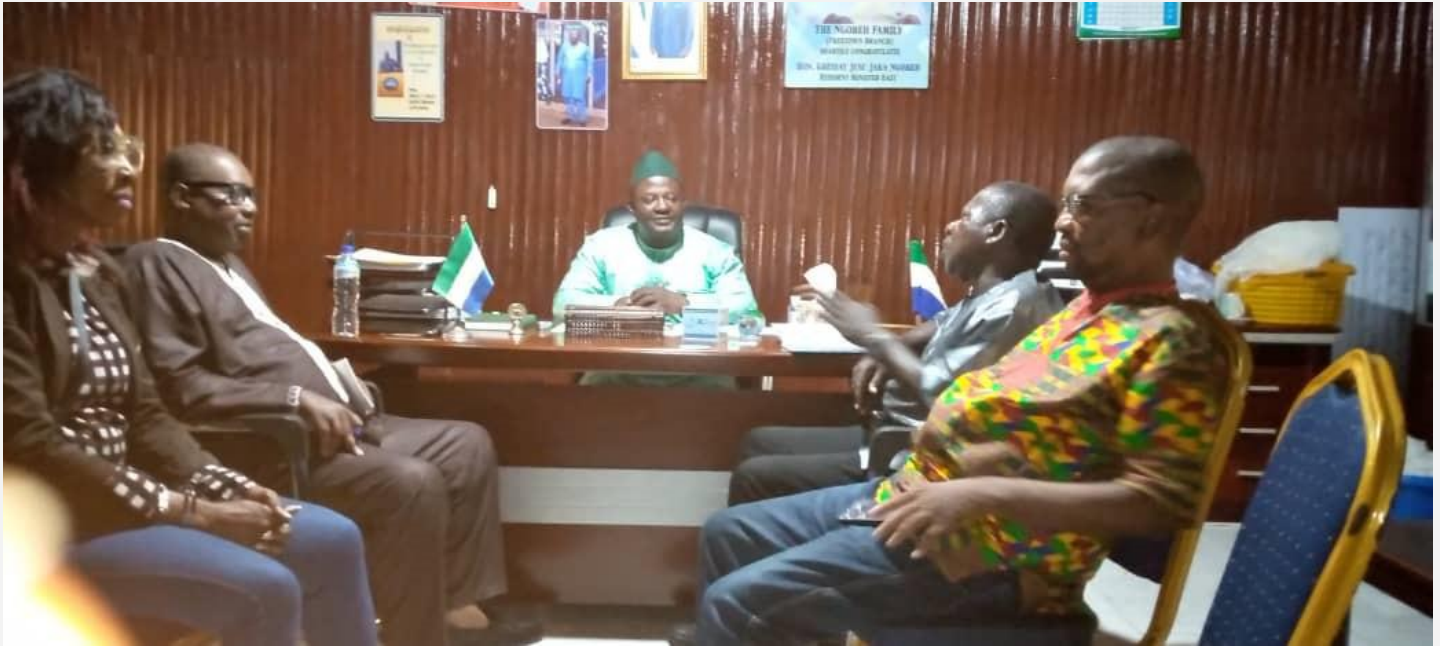
Cross section of NaCSA Regional Staff at the Resident Minister East's Office in Kenema