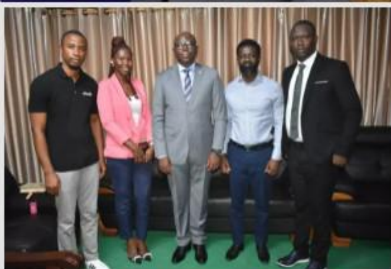
AFRIMONEY PAYS COURTESY CALL ON NaCSA