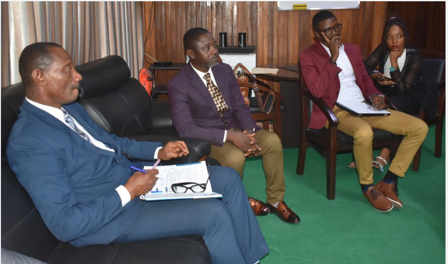
NaCSA staff in attendance at the meeting with Afrimoney