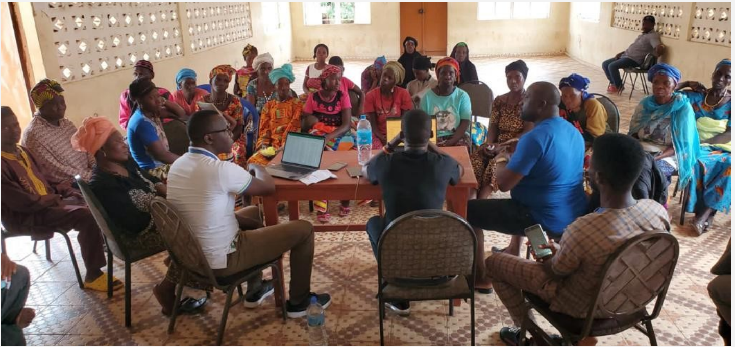
NaCSA and partners engaging beneficiaries of the cash transfer

The National Commission for Social Action (NaCSA) has on Tuesday, September 12, 2023 commenced targeting and enrolment of the remaining pre-listed and verified beneficiaries who are to receive cash under the cash transfer programme. It could be recalled that NaCSA and its implementing partners have completed the targeting and enrolment of 33,287 beneficiaries from female-headed, elderly-headed and persons with disability-headed households. The team was to target an overall beneficiary size of 35,005.