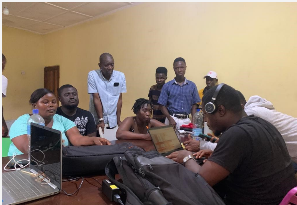
Verification of beneficiaries of the cash transfer by NaCSA team

Consistent with the objectives of the ECT III implementation, the Commission and other stakeholders commenced targeting and enrolment of the remaining caseload totaling 1,718. These beneficiaries have been previously pre-listed and verified. It was however observed that there seems to be discrepancy between the SIM numbers given to the beneficiaries and the number archived for payments.