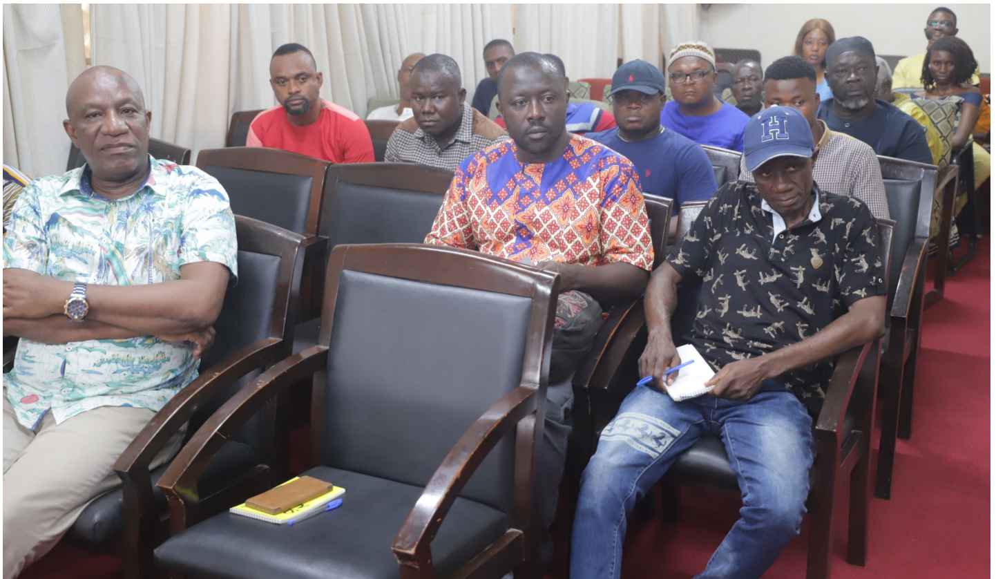
GPC III Programme Manager with prospective bidders at the session

The GPC commenced in 2006, as a result of a Financial Cooperation Agreement between the Government of Sierra Leone (GoSL) and the Government of the Federal Republic of Germany represented by the German Development Bank (KfW). The overall objective of this project is to improve the employment and income situation especially for youths in rural communities by providing enhanced economic infrastructure (feeder roads and bridges, grain stores with ancillary facilities, cattle paddocks and water wells) along selected agricultural value chains, constructed by using labor-intensive approaches.