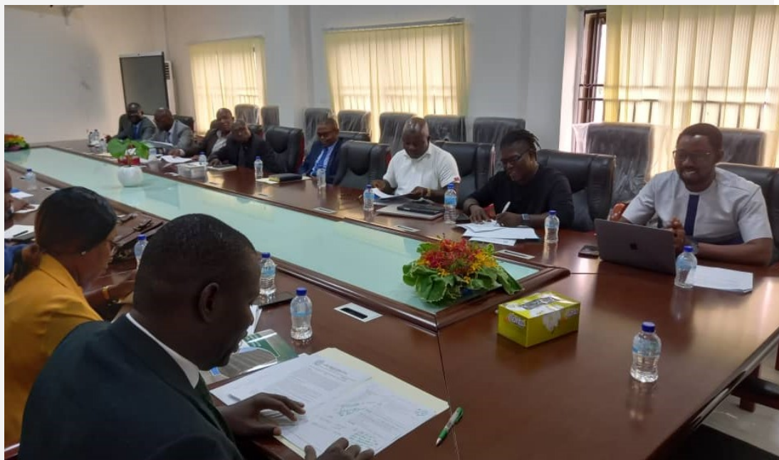
NaCSA Deputy Commissioner Sir Jimmy Batilo Songa giving an update of NaCSA's programmes