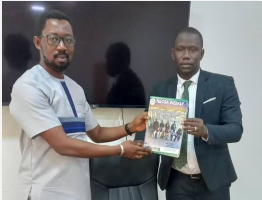
NaCSA Deputy Commissioner presenting NaCSA Newsletters to the Director of Programmes