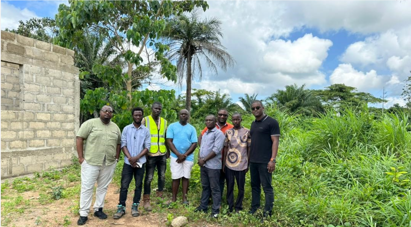
Contractor and team of engineers of Dem SL Ltd with NaCSA Hub staff and member of the Land owning family

The Sierra Leone Community Driven Development Programme II is a community led project which aims to reduce poverty in Sierra Leone. To make this happen, the commission through the project has been promoting access to socio economic opportunities and services to local institutions in seven chiefdoms referred to as rural growth poles.