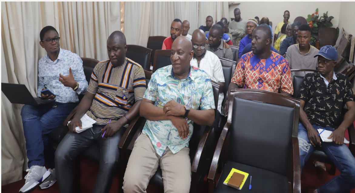
Cross section of NaCSA staff and bidders at the ceremony